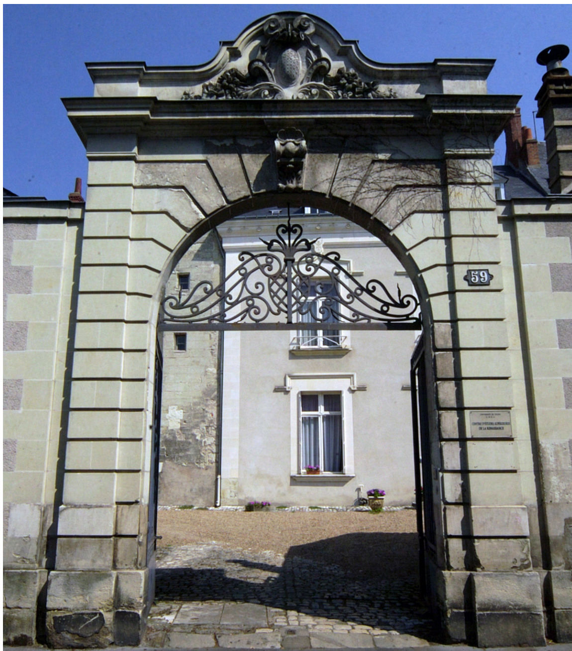
The main gate of the Centre d'études supérieures de la Renaissance, Tours