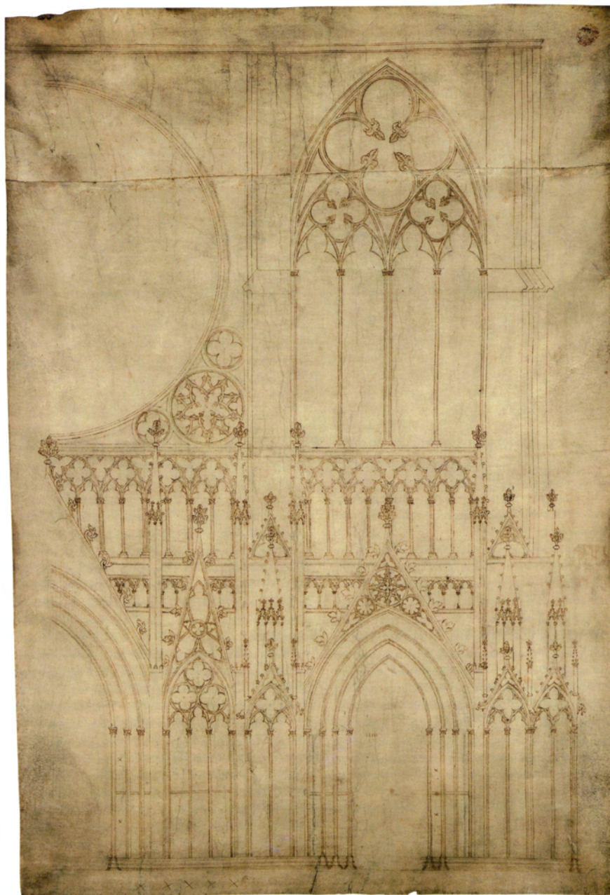
Strasbourg Cathedral façade elevation (Plan A1)