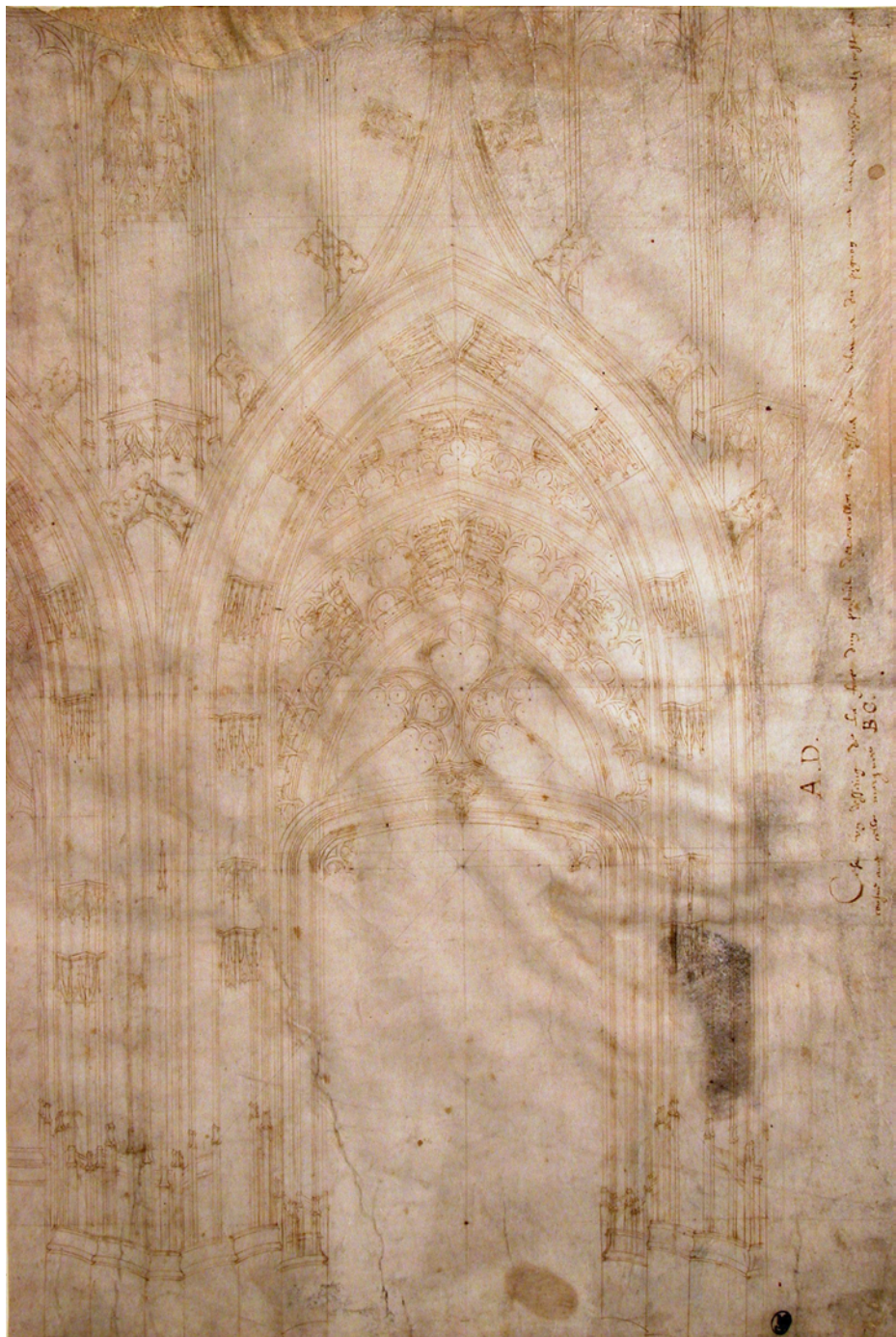
Architectural Drawing, France, 1450 – 1500. Pen and brown ink over black chalk on vellum Photograph: Courtesy of the Metropolitan Museum of Art, the Cloisters Collection, 1968, 68.49